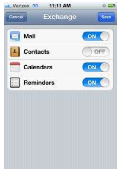
6. When successful, you can select to synchronize Mail, Calendars, and Reminders. Syncing Contacts may overwrite an iPhone Contacts list, so use this option carefully.

Mail and calendars will take a few minutes for initial synch.