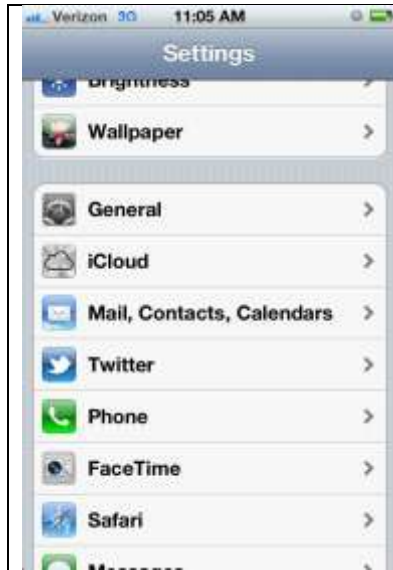
1. Select Settings. Select Mail, Contacts, Calendars