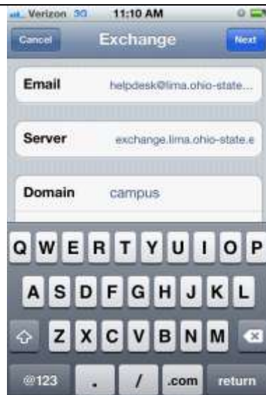
5. The device will attempt to verify settings, then return as above and enter the Server (exchange.lima.ohio-state.edu)