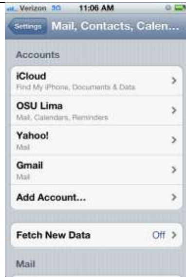
2. Select Add Account...